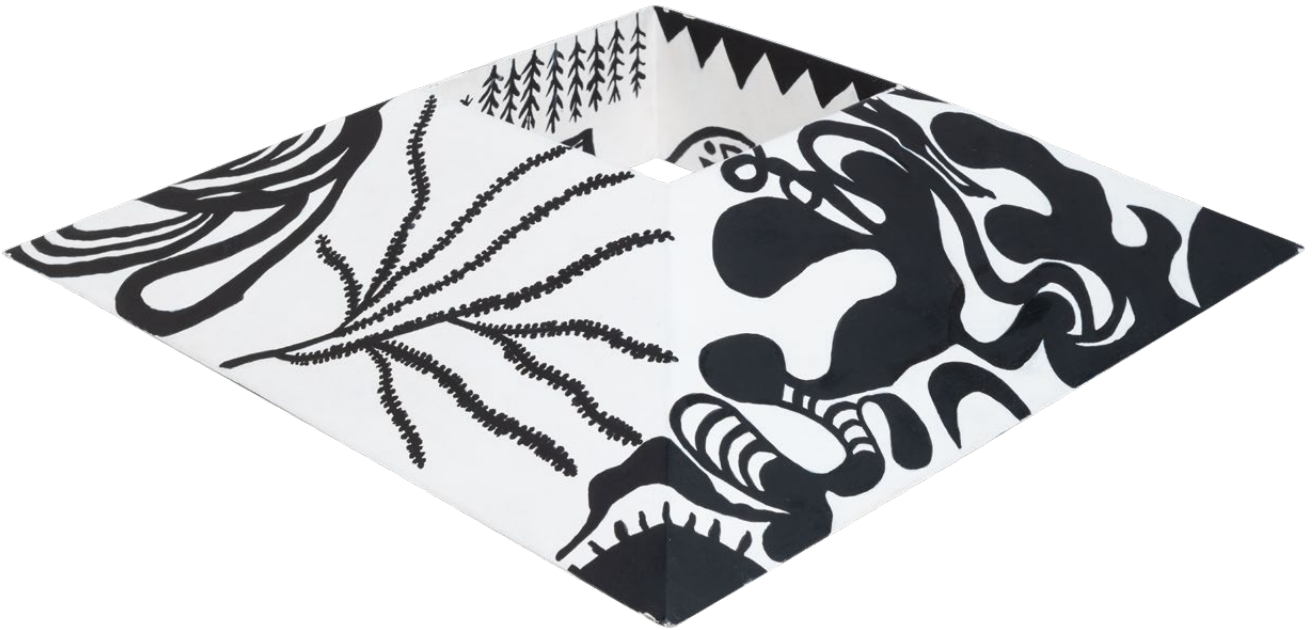
The Hidden Eden #2 (bottom view) Acrylic on recycled teak wood 45 cm x 45 cm x 9 cm 2019 – 2023