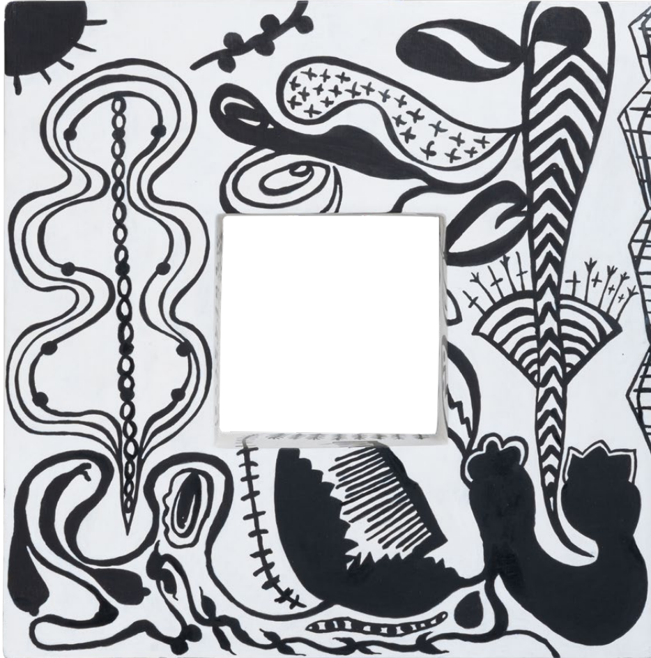
The Hidden Eden #2 (top view) Acrylic on recycled teak wood 45 cm x 45 cm x 9 cm 2019 – 2023