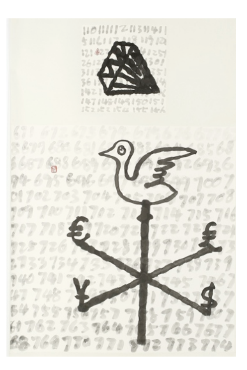
13NS-1 and 13NS1-3 | chinese ink on paper, 31 x 31 cm + 92 x 92 cm, 2013