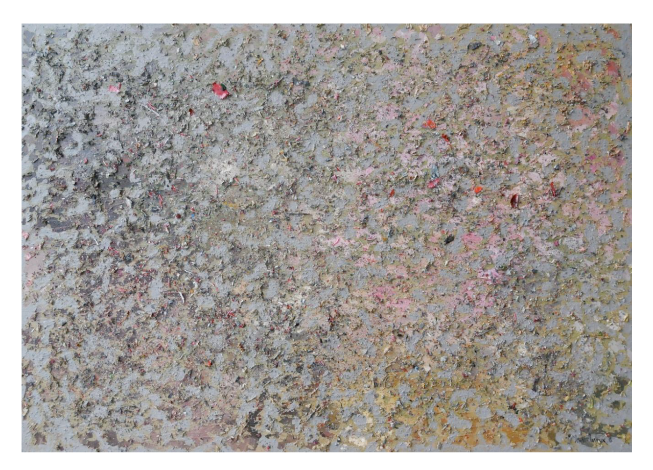
Mat Y.V. Acrylic on Canvas, 162 x 114 cm, 2011

combination of feminine curves and asymmetric libraries suggesting old sailboat parts. A veritable sail dance! This is how he expresses his desire for freedom.