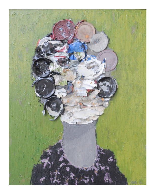
BM – Miss Be Good Y Acrylic on Canvas, 65 x 81cm, 2010