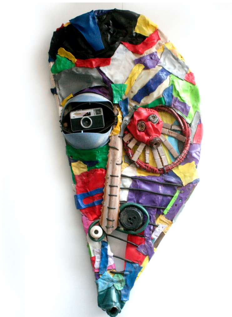
Artist: CLIVE MUKUCHA Title: Contemporary mask Medium: Found objects Size: 120 x 50 x 4 cm Year: 2017