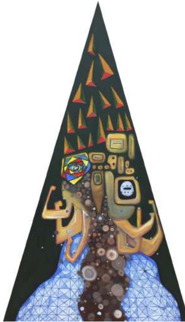
Wong Tong The Power 151 x 84 cm Oil on Canvas 2015