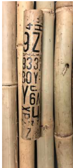
Wong Tong Numbers Sound Installation 2020